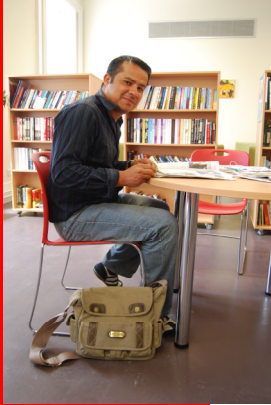
A client using our recently refurbished Activities Room

“The new building is fantastic. It is wonderfully bright, airy and spacious. We have received so many positive comments about the building. It has made both staff and clients feel quite proud to be in such a beautiful space. The clients say it makes them feel special”