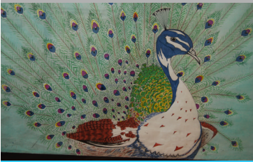
Detail from "Peacock" A painting by one of our art group members

We celebrated our first official art show in the new building on 17 th September 2008. Our art group, which